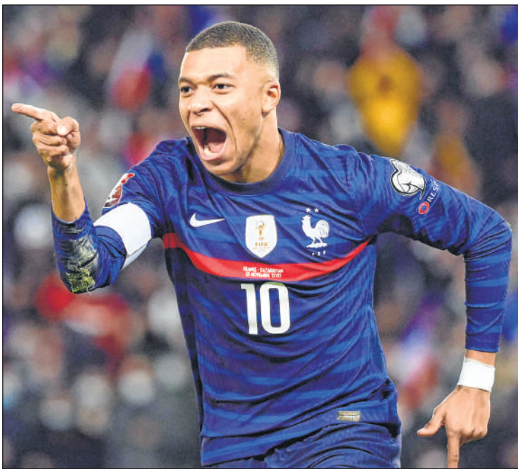
France's forward Kylian Mbappe celebrates after scoring a goal

"I don't know what to say. Unbelievable," Netherlands captain Vir-